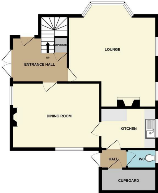
1ST FLOOR 606 sq.ft. (56.3 sq.m.) approx.